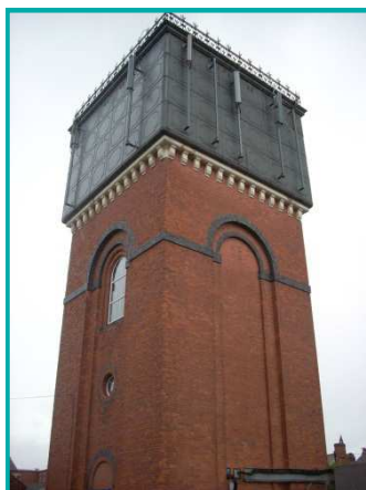
Hinckley Water Tower, constructed 1889. A likely inclusion within a local heritage list

A list of local heritage assets is being developed by the council with assistance from local stakeholders. The local heritage list will identify heritage assets that merit protection due to their contribution to local character and distinctiveness but do not meet the criteria to be statutory listed.