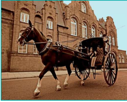
The restored cab on Station Road, Hinckley