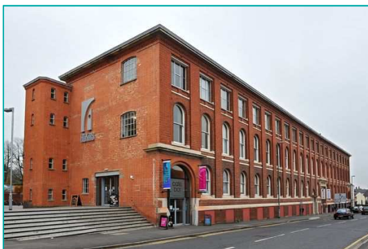
Atkins building exterior

With the aid of funding from East Midlands Development Agency (EMDA) and English Heritage the council purchased the grade II listed former Atkins hosiery factory and it has been redeveloped and converted to provide creative studios, serviced office space, an art gallery, café, and meeting and function rooms. It is currently thriving and a positive example of the constructive conservation of the borough's hosiery manufacturing heritage.