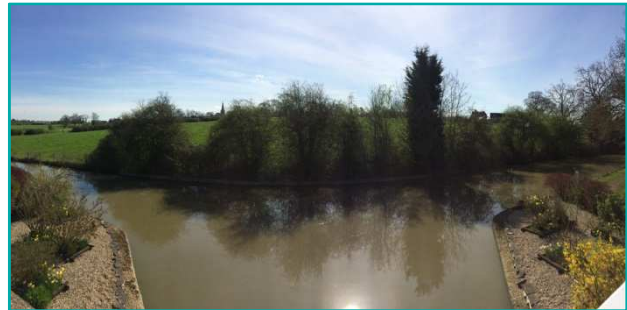
Panoramic view of Crown Hill at Stoke Golding, location of the crowning of Henry Tudor in 1485

1 Registered Battlefield , identified by Historic England to offer protection through the planning system due to its national significance. The Battle of Bosworth in 1485 marked the end of the Plantagenet dynasty as King Richard III was killed in the battle leading to the crowning of Henry Tudor and the ascension of the Tudor dynasty. King Richard III's reinternment took place at Leicester Cathedral in 2015 following the discovery of his remains in a car park, with his cortege procession passing through key locations across the battlefield and through Market Bosworth and associated villages.