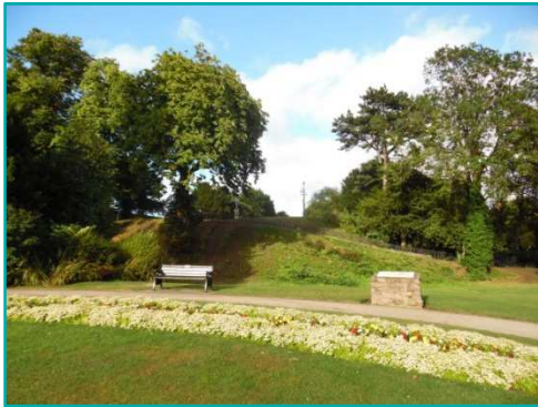
Remains of the motte and bailey castle in Hinckley, a scheduled monument

22 Scheduled Monuments , designated by the DCMS on the advice of Historic England to recognise the national importance of these archaeological sites. Types of monuments in the borough include Neolithic bowl barrows, an Iron Age hill fort, Roman villas and settlements, Saxon burial mounds, Norman motte and bailey castles, Medieval moats and fishponds, farmsteads, manorial complexes and deserted villages. A great number of local archaeological sites are also recorded on the Historic Environment Record.