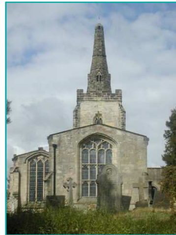
Church of St Edith, Orton on the Hill. A C14 grade I listed building

340 statutory listed buildings , designated by the DCMS on the advice of Historic England to mark and celebrate a building's special architectural or historic interest. Listed buildings are graded according to their quality and interest and within the borough 8 are listed at grade I, 36 are listed at grade II* and 296 are listed at grade II. There is a wide range of buildings and structures on the list including churches, farm houses and farm buildings, cottages and manor houses, war memorials and commemorative structures, former hosiery industry buildings, public houses, walled gardens, bridges, railings, telephone boxes and village pumps.