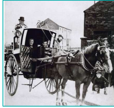
A cab near to Hinckley railway station, late-19 th century