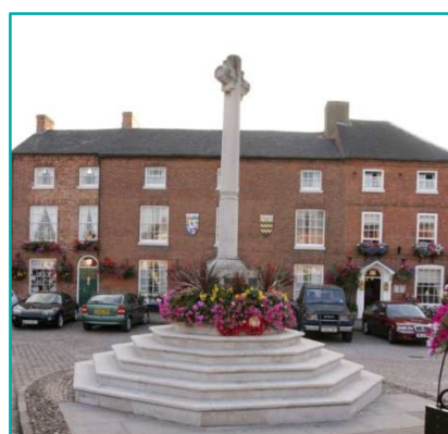
The market place at the centre of Market Bosworth Conservation Area

which have been designated as an area of special architectural or historic interest. Such areas include the length of the Ashby Canal within the borough, centres of the hosiery and boot and shoe industries, historic town and village centres, and areas around historic parks.