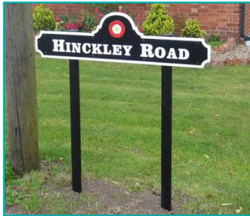
Street name plate, Dadlington

parish to utilise their existing or design an appropriate image that represents their area and to contribute to local distinctiveness. The lights consist of an ornate cast iron lighting column and lantern which complements and enhances each area, being far more aesthetically pleasing than modern lighting equivalents.