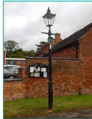
Street light, Sibson